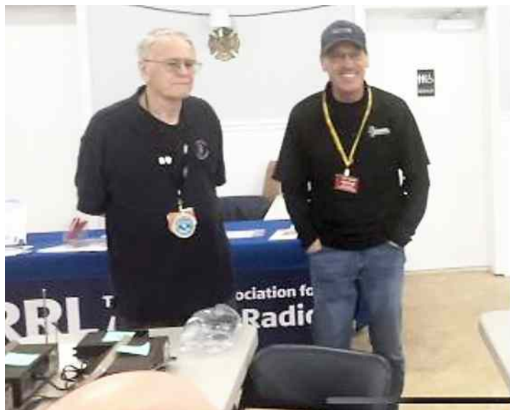
WB2ALJ and N2XW, ARRL SNJ Leadership at the OBARC Hamfest

We are still offering a Ten Tec Argosy 525 rig for $150 and will be offering it at the Gloucester Hamfest later this year.